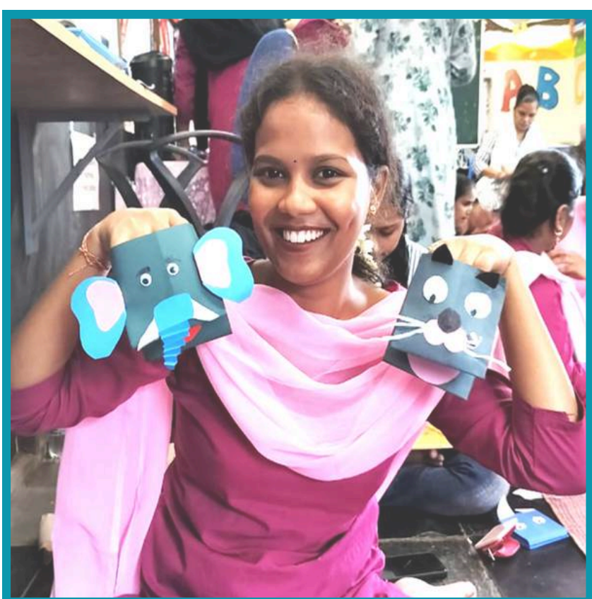
Akansha Veersami Podar International School Salary : 16,000/-